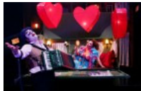
COME TO THE CABERET, OLD CHUM!